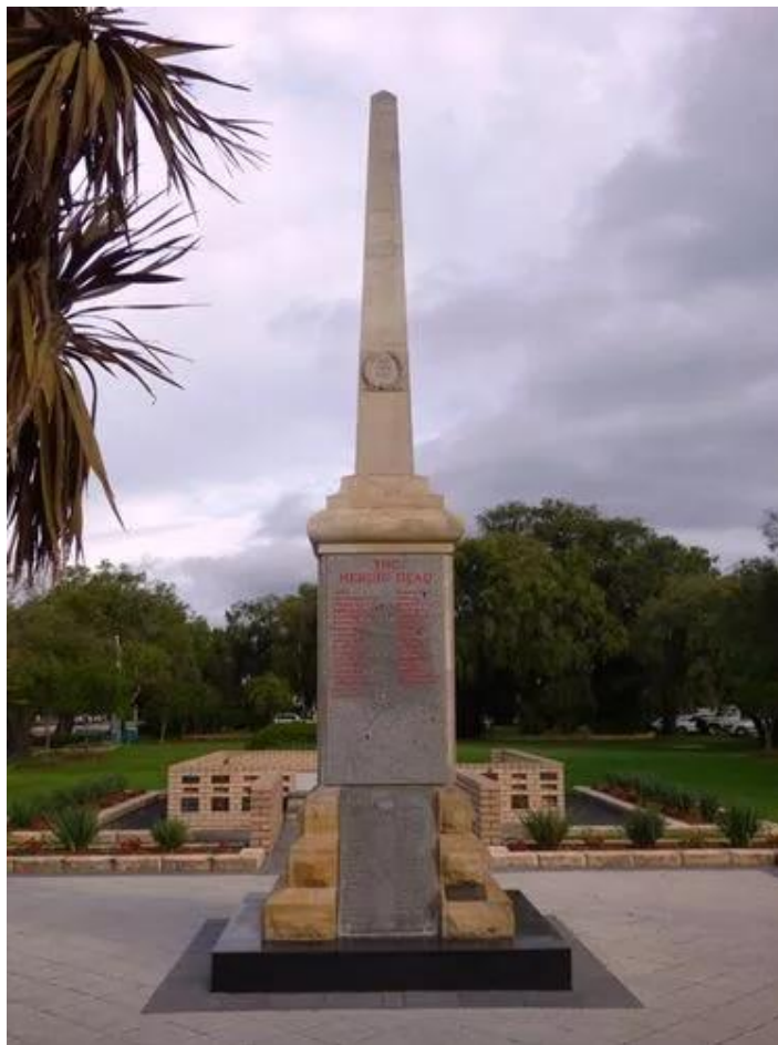
Busselton War Memorial